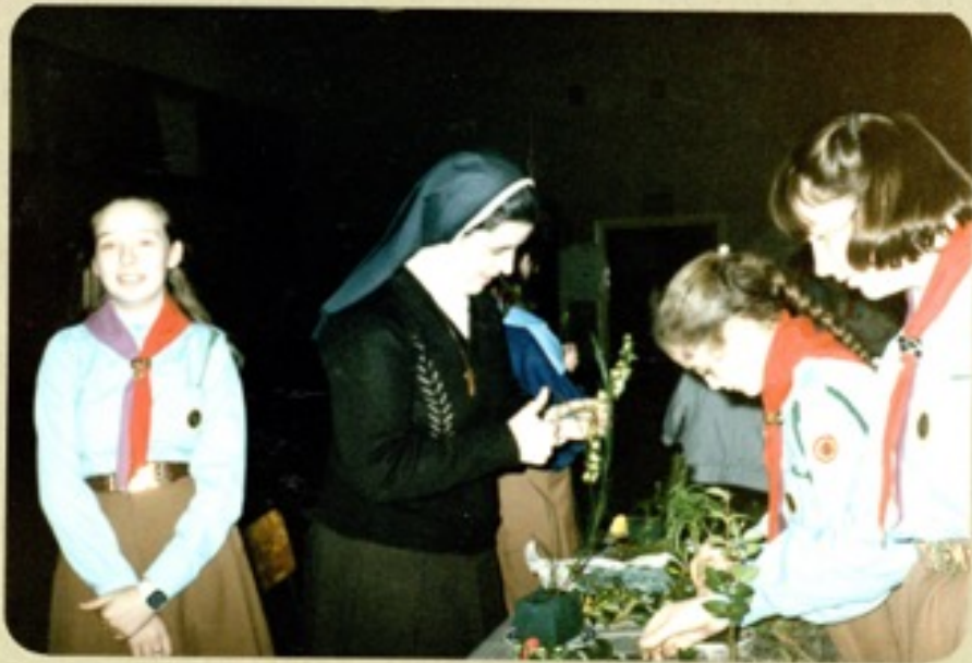
Flower arranging with the Guides