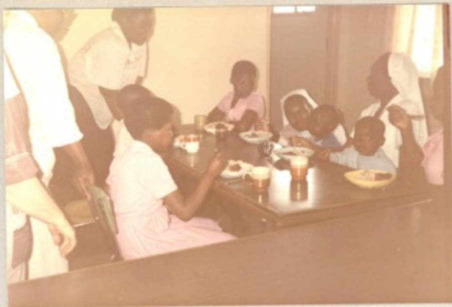
Tea-time at our African Orphanage