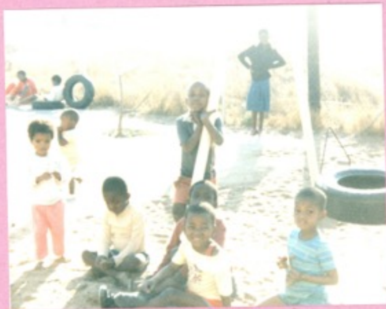
Zulu orphans in Natal, S. Africa