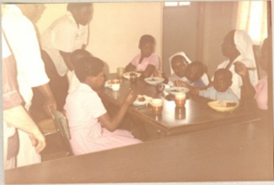
Tea-time at our African Orphanage