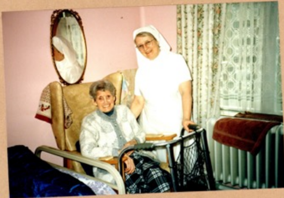
Care of the elderly at home - visiting the lonely is a Franciscan Minorress' priority.