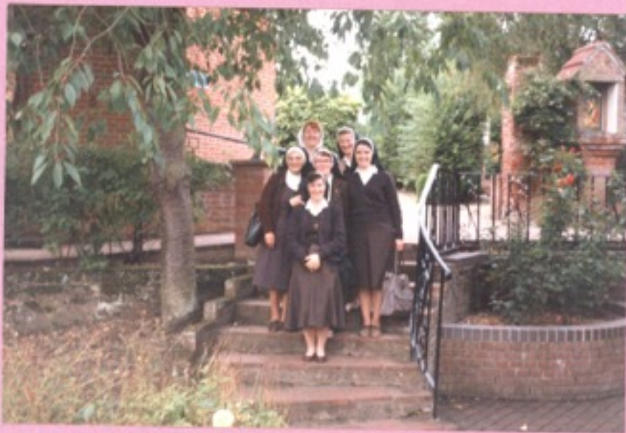
An outing to Walsingham.....1988