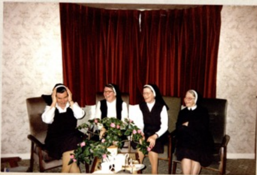
At home in Cabra