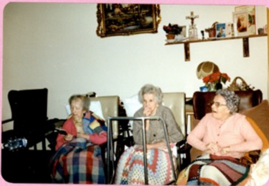
St. Anthony's Home for the elderly