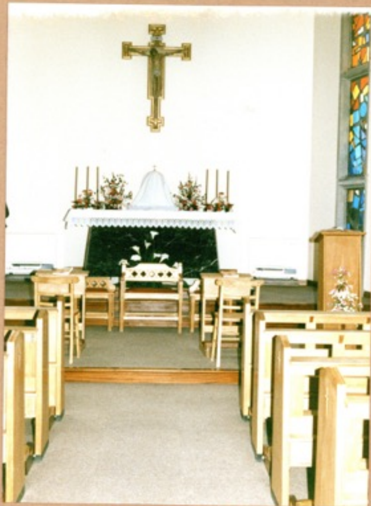
St. Francis' Chapel, Melton Mowbray