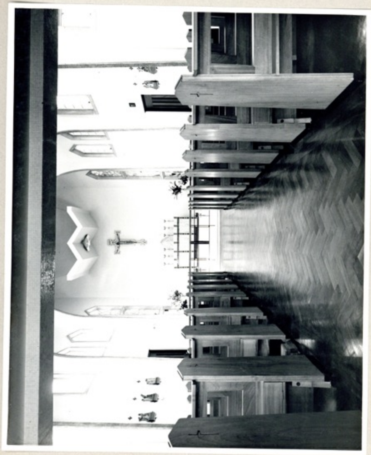
A Franciscan Convent Chapel in England