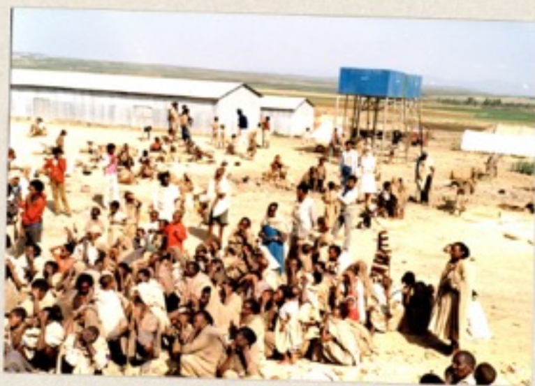
The Sisters are involved with famine victims in Ethiopia