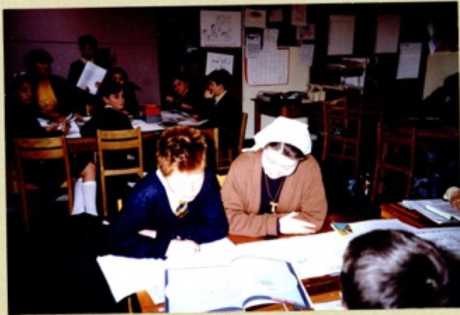
Teaching Experience for our novices at Christ the King School, Alfretton.