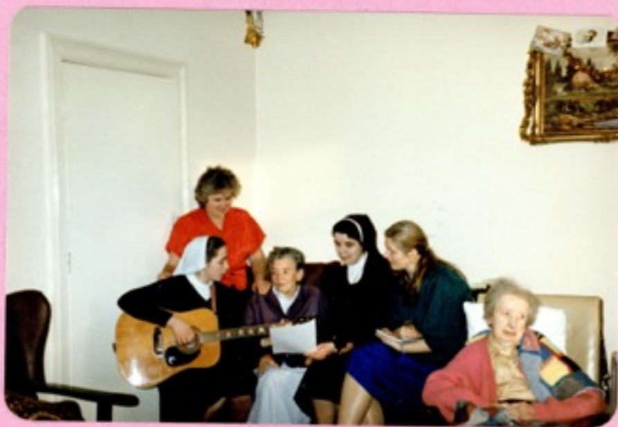
The Sisters entertain the elderly at St. Anthony's Home