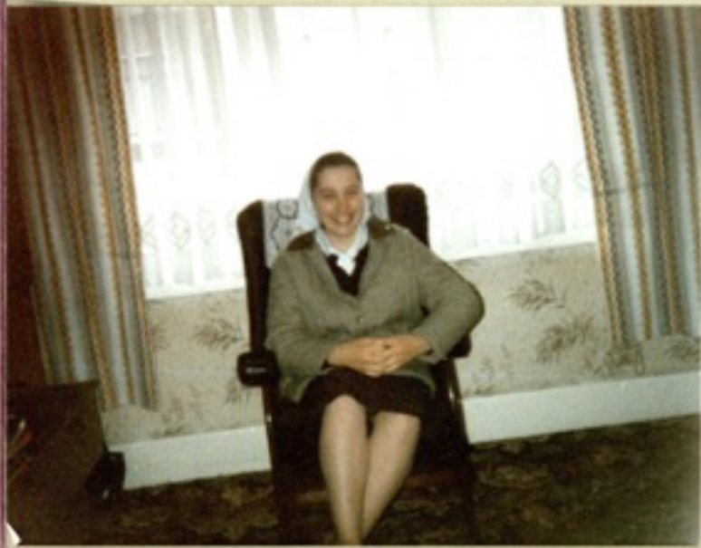
Sv. Patricia Mary