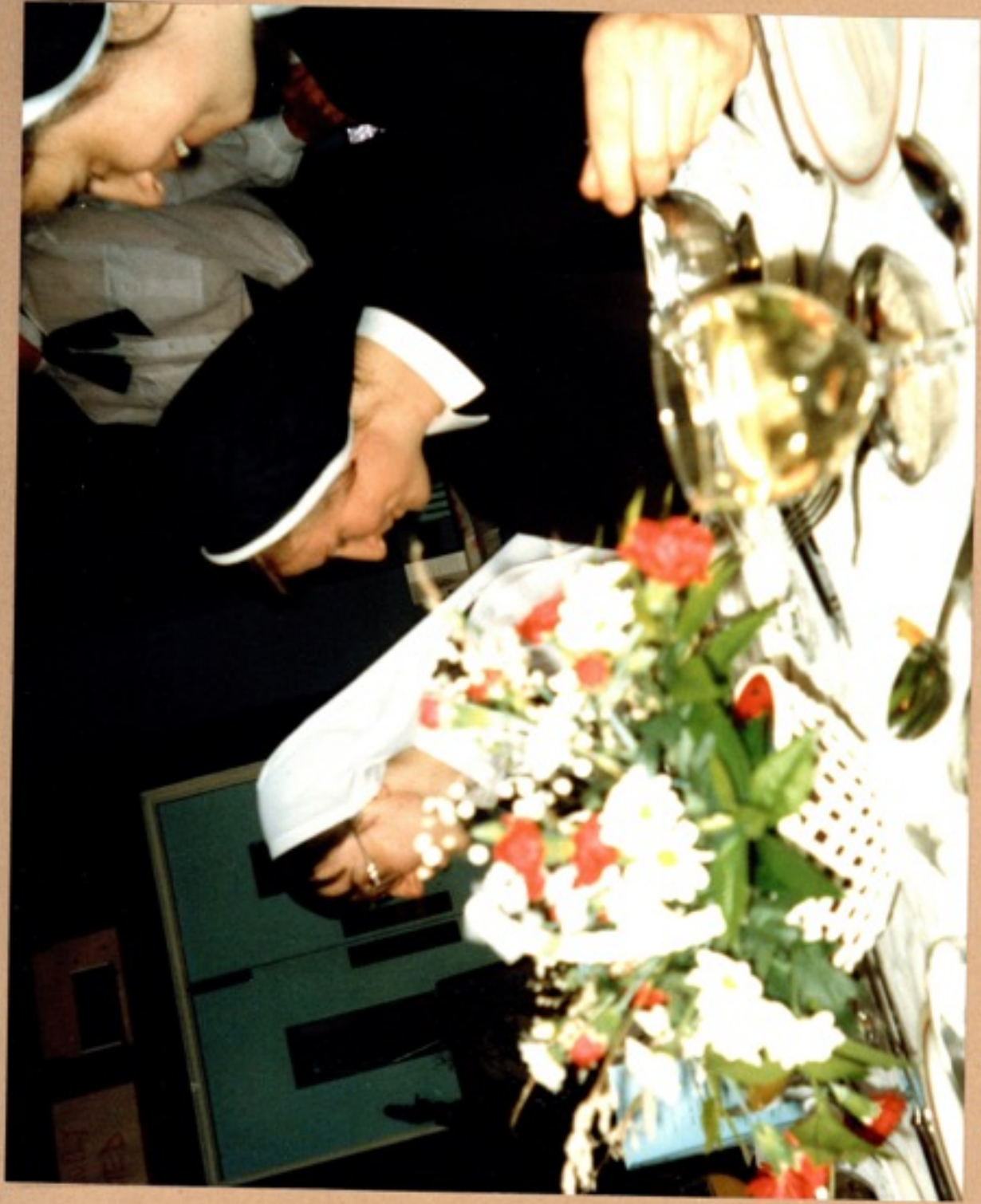
1888 - 1988 ... Centenary Celebration... 2nd August 1988