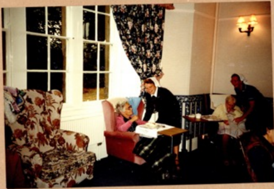
Novices help the elderly in Clay Cross