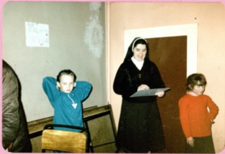
Helping at the parish youth centre