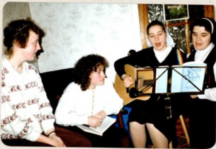
Singing with local Youth in Cabra