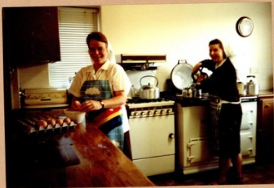
Helping in the kitchen in St. Clare's