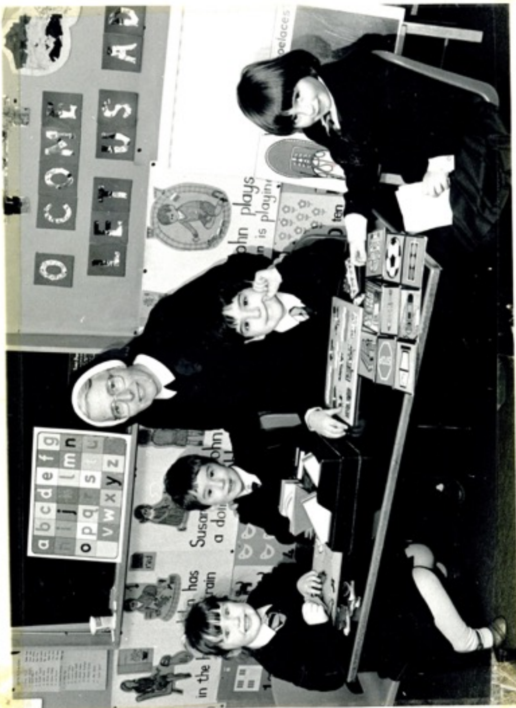
Sisters at work