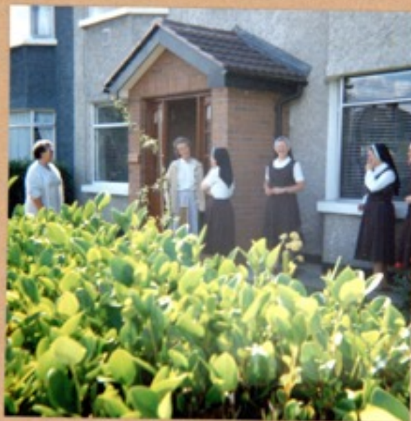
Coming to our Oratory for a Prayer Meeting (Cabea)